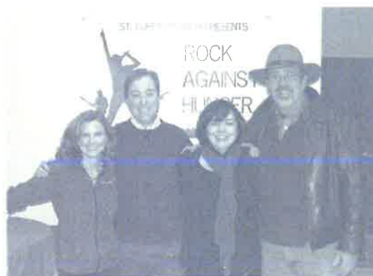
Rock Against Hunger, held at St. Luke’s on February 13, 2015. The community turned out in great numbers, and proceeds benefitted United Community Ministries and Rising Hope. Two bands performed, Purple Isn’t Six and Josie Sang. Primo’s Family Restaurant donated pizza, which was sold along with drinks and desserts. We raised approximately $2100 for our cause.